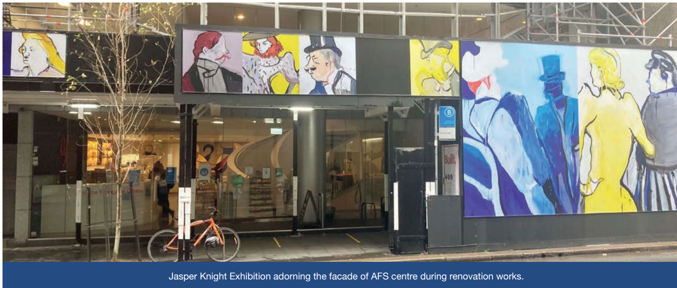
Jasper Knight Exhibition adorning the facade of AFS centre during renovation works.