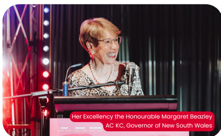
Her Excellency the Honourable Margaret Beazley AC KC, Governor of New South Wales